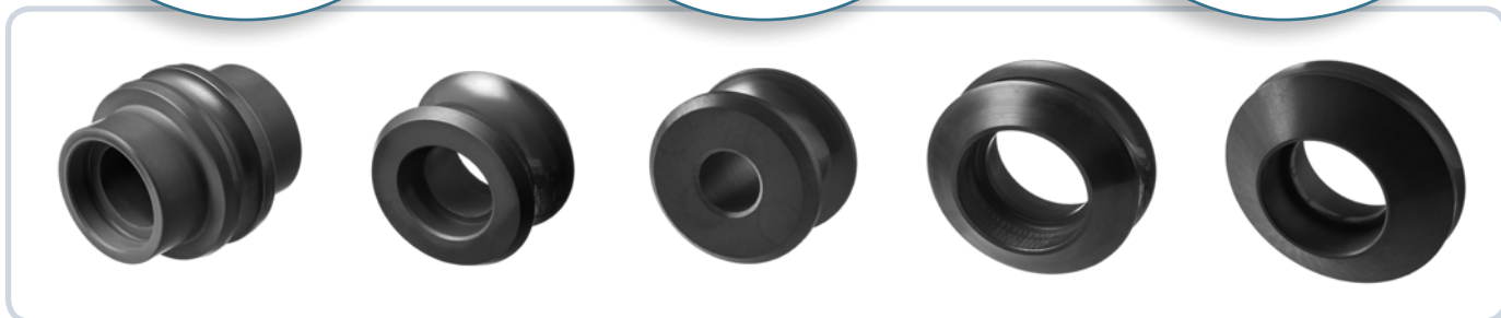
In nitruro ceramico - Ceramic nitride