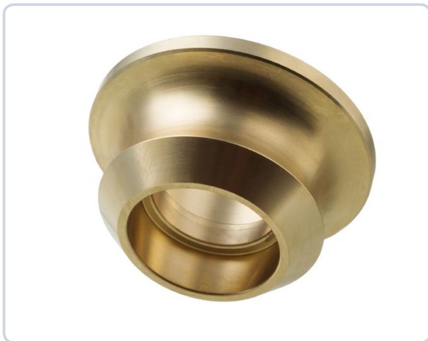
In lega di bronzo - Bronze alloy made