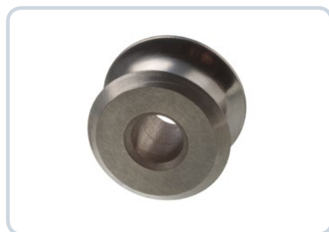
In metallo duro - Hard metal